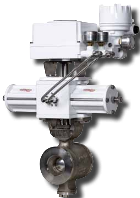
Valtek ShearStream SB

effective continuous operation. They have an extremely long life span as all parts are of highest quality. And they'll still be safe in the future as they use advanced technology and innovative solutions. Flowserve ensures a safe and cost-effective operation for our customers all over the world