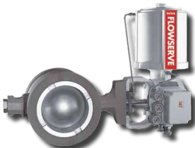
Valtek ShearStream HP